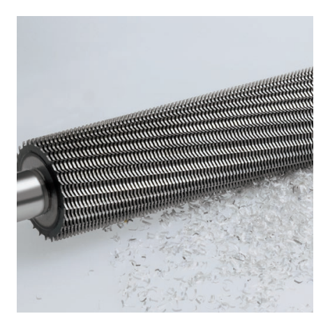
SOLID STEEL CUTTING SHAFTS Robust and durable: high-quality cutting shafts.