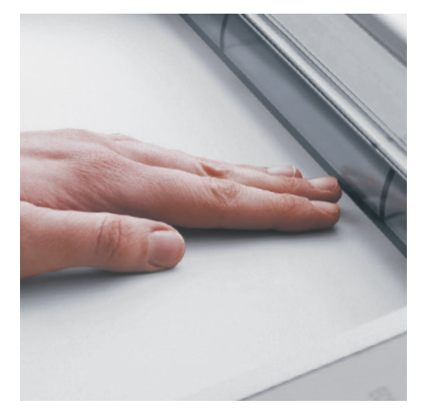
PATENTED SAFETY FLAP

ECC+ – ELECTRONIC CAPACITY CONTROL This electronic feature indicates the used sheet capacity during shredding process to avoid paper jams.