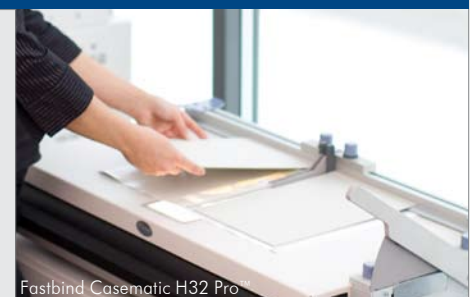
Fastbind Casematic H32 Pro

The BooXTer Duo features a special built-in casing unit to easily attach the hard cover to the pre-bound contents. You insert the cover in the groove to maintain it and just peel-off the end-sheets with your free hands.