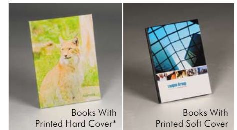
Books With Printed Hard Cover*