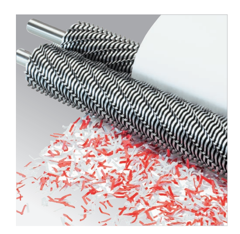
SOLID STEEL CUTTING SHAFTS

Robust and durable: high-quality paper clip proof cutting shafts with lifetime guarantee under conditions of fair wear and tear.