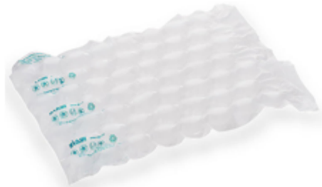
Wrap up bag