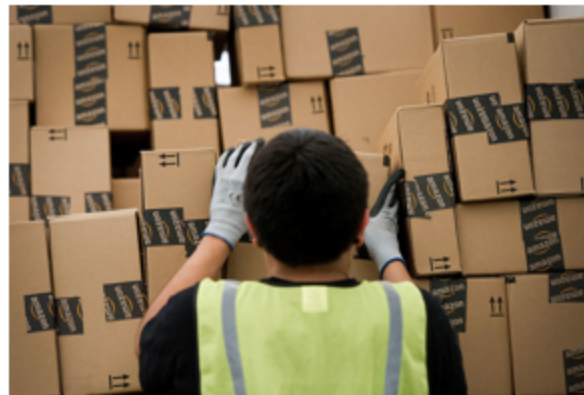
Express delivery center