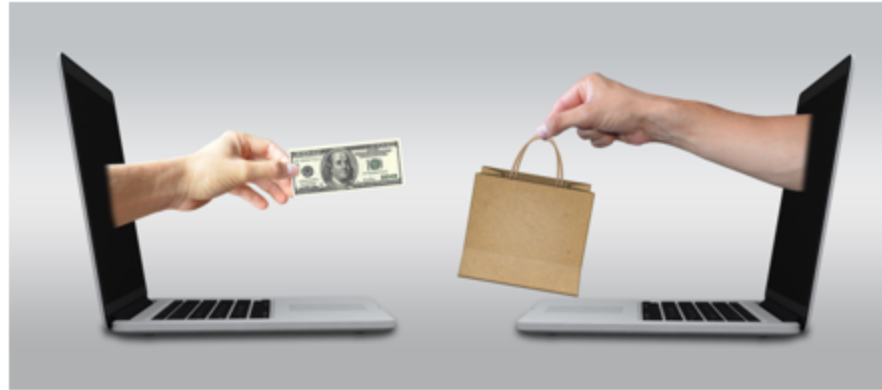
Small e-commerce business

WiAIR 1200 air cushion machine is design for small e-commerce business, small office packaging ,mail or express parcel delivery protection, produce as a void filling or wrap up packaging materials, it can also be used in retail store or outlets parcel package protection.